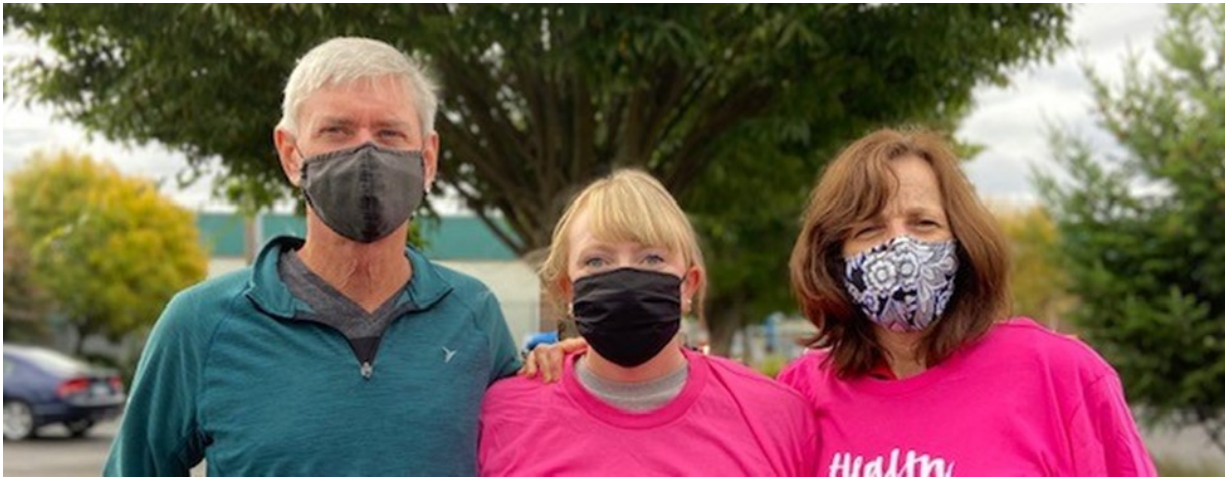
Continuing to mask up to protect people around me.

In school, you're taught that the best OTs are those who know how to be flexible. I don't think I (or anyone) really knew what that meant until now. For months, I have watched therapists around me adjust and plan, only to be met with new restrictions and challenges at every turn. No one teaches you how to retrain someone with aphasia or apraxia to brush their teeth when you have a mask on your face. Covid-19 has brought with it plenty of challenges, but I believe that it has also reinforced the importance of what we do. Helping people engage in meaningful activities and participate in their routines is a powerful thing when surrounded by so much unknown. I feel fortunate to have learned from incredible OTs throughout this experience who have provided me with endless patience and support. The saying, "teamwork makes the dream work" has never been more true. Most of all, I have learned that even the best laid plans fall through; but if you can adapt and trust the process, you may find that your new path is even better than the one you planned.